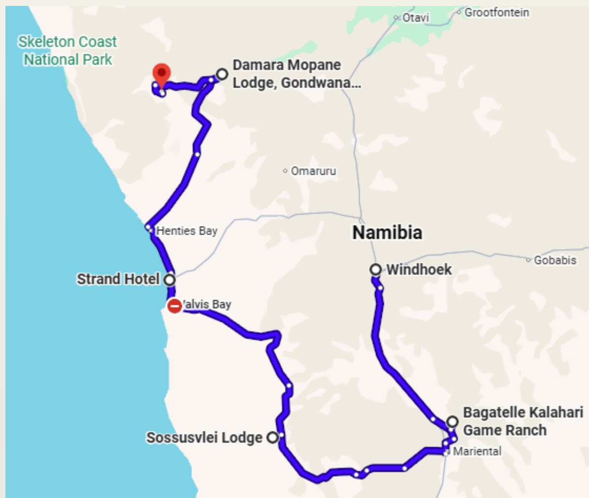
LEG 1 - KALAHARI - SESRIEM/SOSSUSVLEI - SWAKOPMUND - DAMARALAND