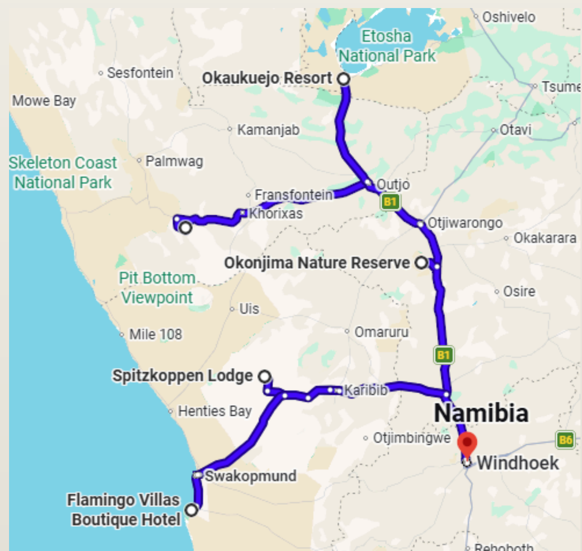
LEG 2 - DAMARALAND - ETOSHA - OTJIWARONGO - SPITZKOPPE - WALVIS BAY - WINDHOEK

ROUTE: KALAHARI - SESRIEM/SOSSUSVLEI - SWAKOPMUND - DAMARALAND - ETOSHA - OTJIWARONGO - SPITZKOPPE - WALVIS BAY - WINDHOEK