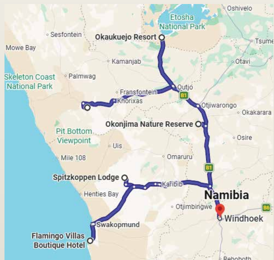
LEG 2 - DAMARALAND - ETOSHA - OTJIWARONGO - SPITZKOPPE - WALVIS BAY - WINDHOEK

ROUTE: KALAHARI - SESRIEM/SOSSUSVLEI - SWAKOPMUND - DAMARALAND - ETOSHA - OTJIWARONGO - SPITZKOPPE - WALVIS BAY - WINDHOEK